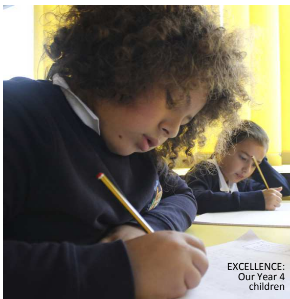
EXCELLENCE: Our Year 4 children

Thank you all for your great efforts in ensuring that your children come to school in uniform every day. I have spoken to some of the older children in particular about coming to school in their black shoes and then changing at break and lunch time into trainers if they so wish. It is important that children do not come into school in their trainers as, understandably, other parents will