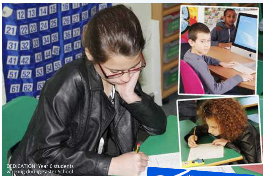
DEDICATION: Year 6 students working during Easter School

Enjoying our learning... ...aiming for excellence.